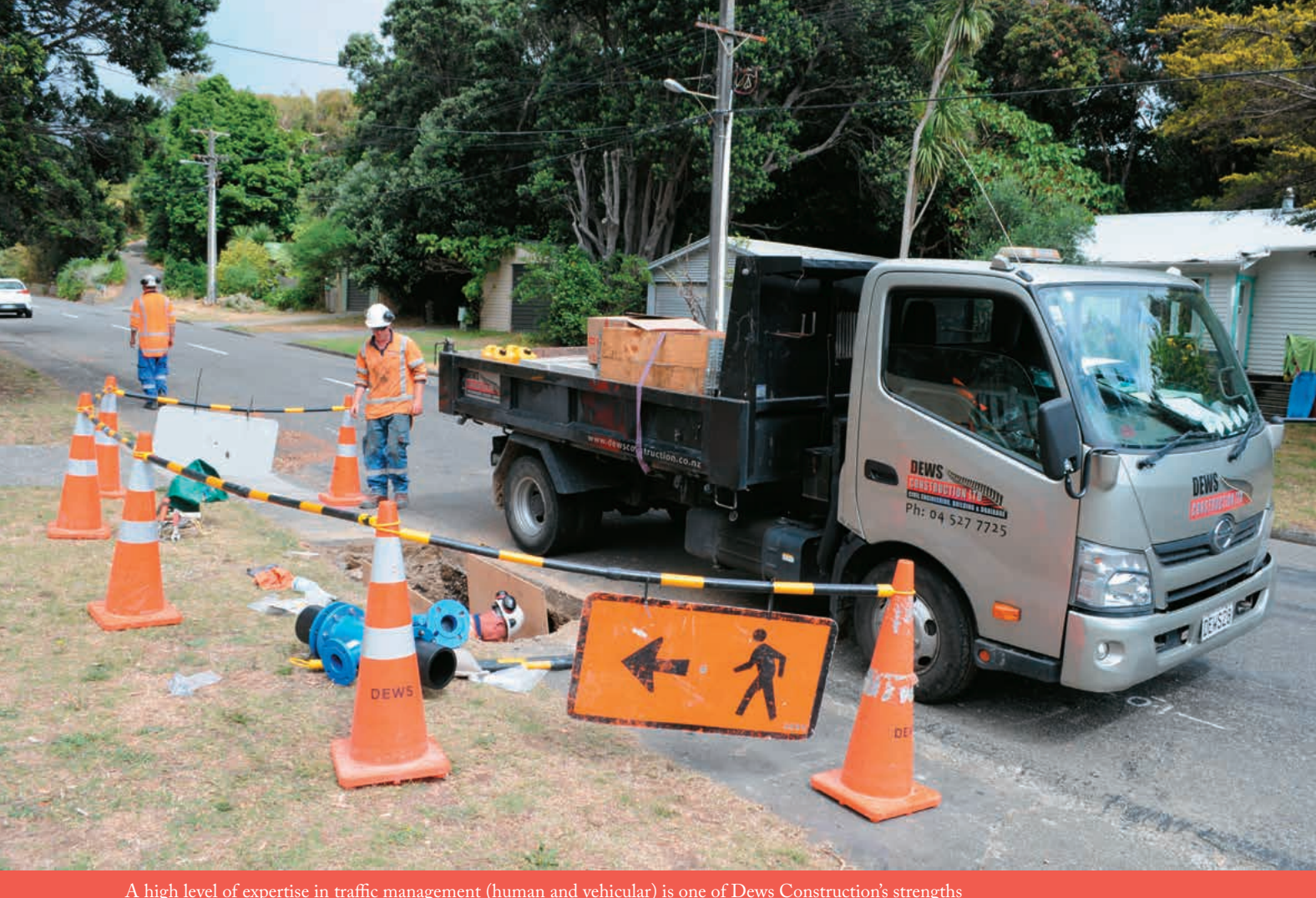
A high level of expertise in traffic management (human and vehicular) is one of Dews Construction's strengths

trenches on narrow thoroughfares, says Dave, but is just as useful from a traffic management point of view in helping minimise the space taken up by a project.