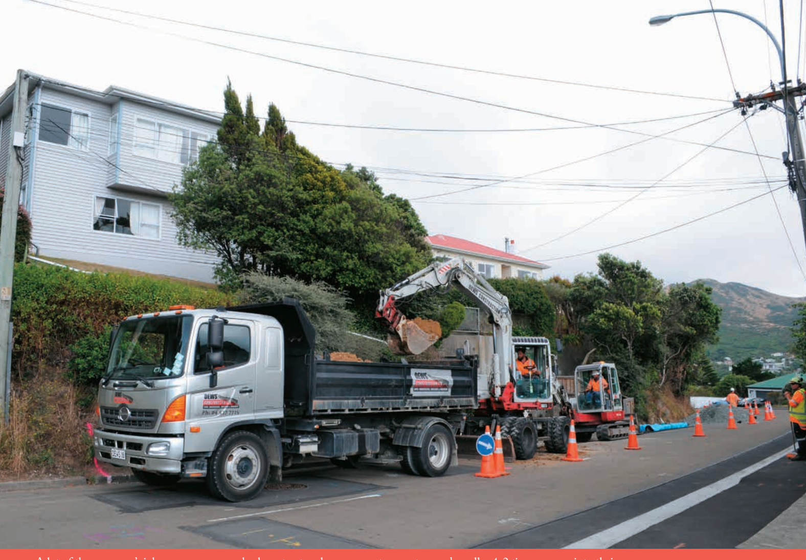
A lot of the company's jobs are on narrow suburban streets, where compact excavators and smaller 4x2 tippers come into their owr